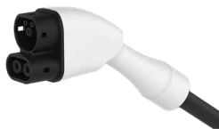
Combo CCS Type 2